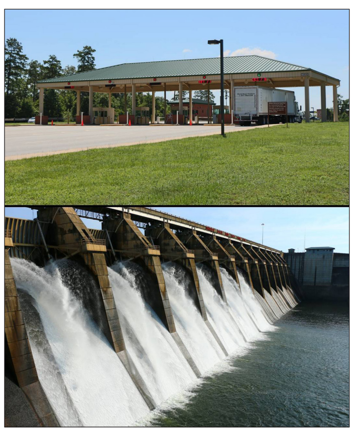
Huntsville Center's Electronic Security Center provides worldwide support for military programs and civil works.

The ESS PDT includes project engineers, project managers and contracting professionals who work together along with our customer to outline requirements, develop Performance Work Statements (PWS) and issue Requests for Proposal (RFP), resulting in contract awards to qualified contractors offering the best value to the government. Our highly functioning PDT ensures that our customers' needs are fully identified and products are delivered in accordance with customer requirements and specifications. We have a proven civ capability to deliver ESS products and services worldwide.